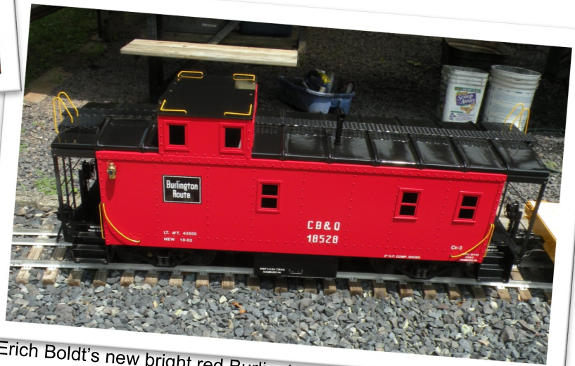
Erich Boldt's new bright red Burlington Route caboose