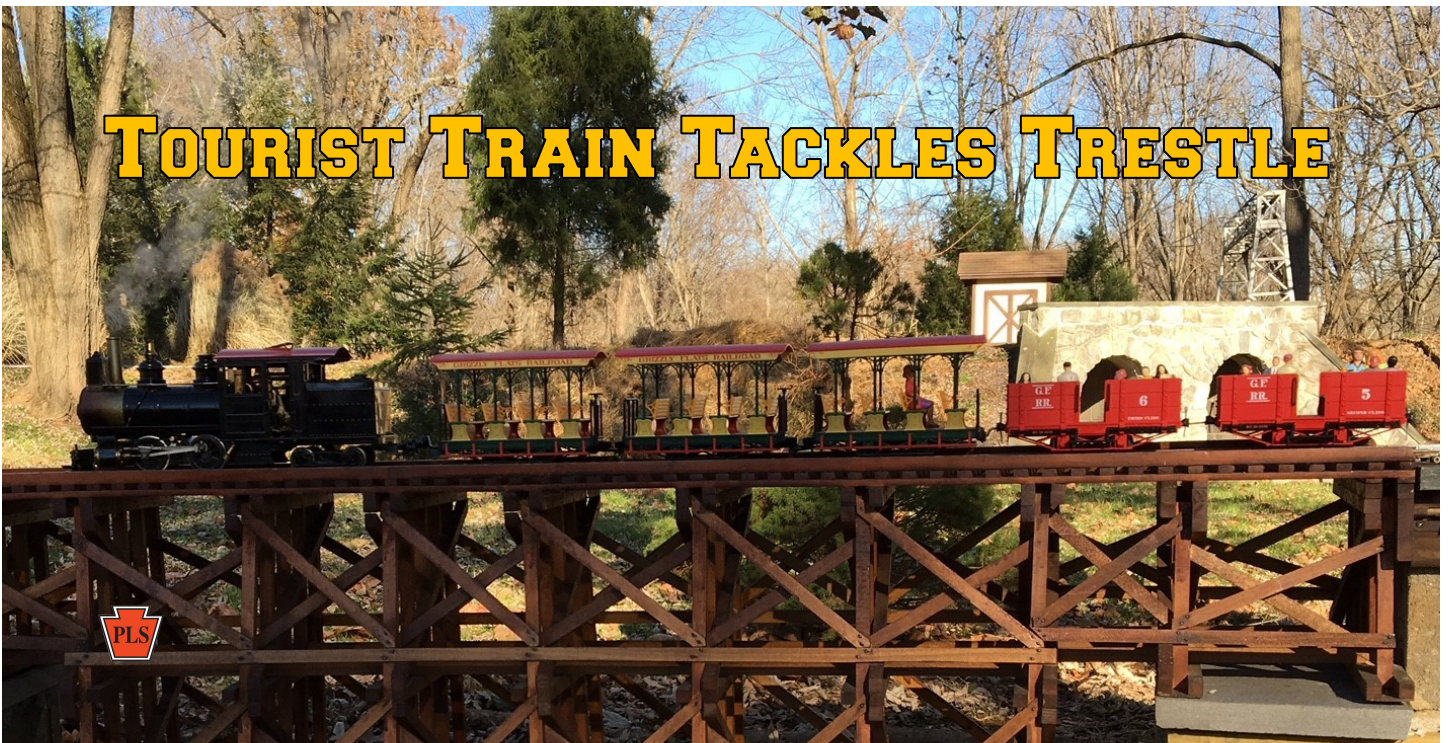
A Fourney locomotive crosses the gauge 1 trestle during the Turkey Trot Run on Friday, November 24, 2017. Warm weather brought out a larger than average number of engineers and guests to this annual event.