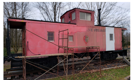
Photo 3 - Caboose Sanding and Priming

the south side was sanded and primed. This test panel looks very good (See Photo 3). Around the first of November we set up scaffolding and started to sand out the entire south side. The area that has been sanded looks good and weather permitting, we will apply at least one coat of primer to the newly sanded areas. What we have