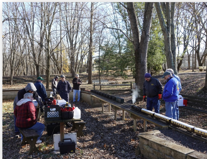
Still a lot of activity later in the day