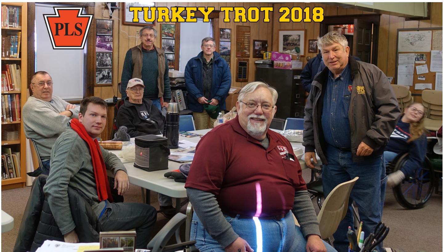
The Gauge 1 Crew takes a lunch break during the cold at this year's Turkey Trot event on Black Friday. See more photos on page 5.