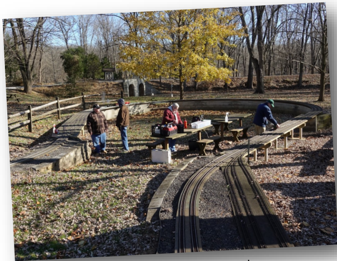
View from atop the tunnel