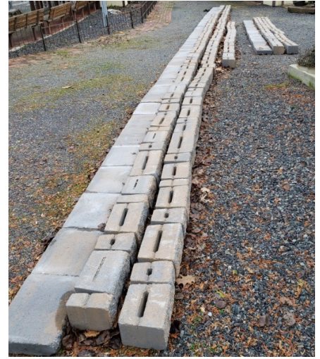
Photo 2 - Block Layout ready for transfer