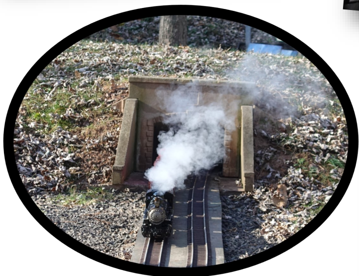
Cold air made for some great steam plumes