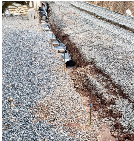
Photo 1 - Trench/Footing ready for New Wall