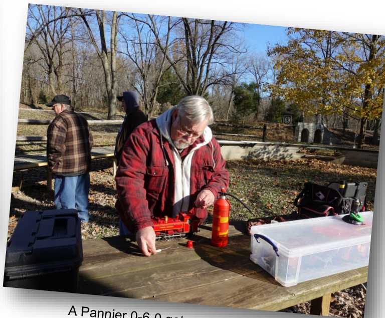
A Pannier 0-6-0 gets prepped for a run