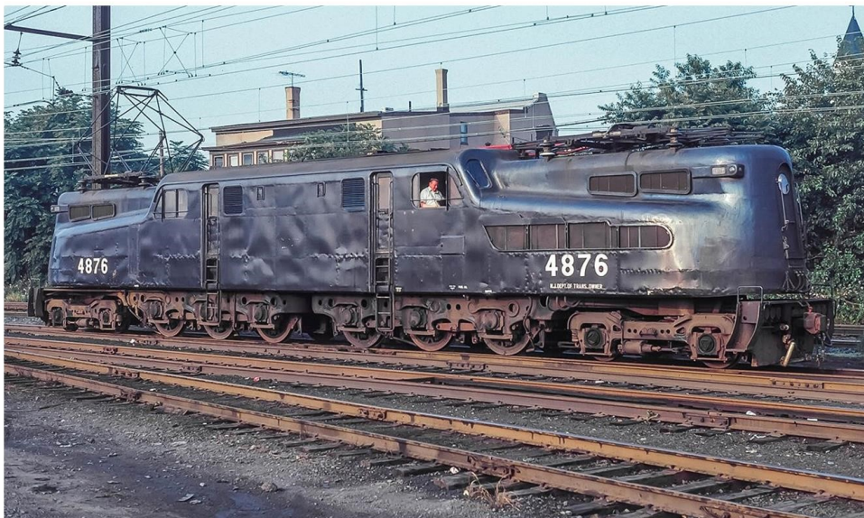
4876 under ownership of NJT in yard at Rahway, NJ circa 1982. Ripples in side sheets are exaggerated by the angle of the light.

Dust was still settling as PRR officials began to confront the problem of extracting 4876 from its resting place in the Baggage Room, one floor below track level. A crucial question in planning how 4876 would be removed was whether it would be more economical to rebuild it or just scrap it and build a new GG1. To answer that question a mechanical engineer from PRR Wilmington Shops made a survey of the damaged locomotive for a comprehensive report issued on January 28 th . The answer to the question of "rebuild-or-scrap" was obvious from that report: Estimated cost to rebuild 4876 from new and