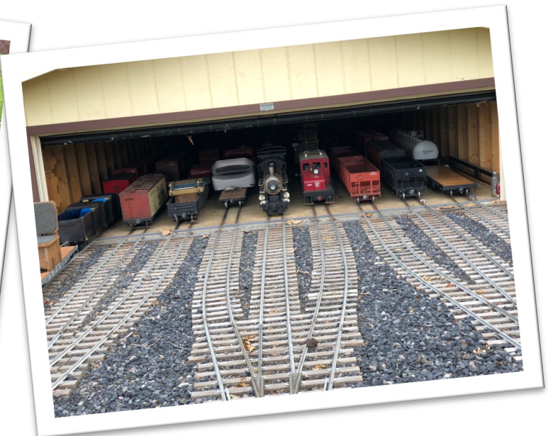
Pete Brown Photos