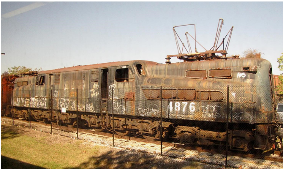
4876, vandalized and rotting in Baltimore, MD.