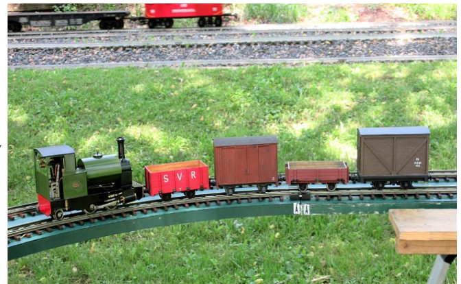
O gauge model of a British narrow gauge loco built for the Bowater Paper Company mills in Kent

Participants in the Annual Gathering came from well beyond the Mid-Atlantic states; we had folks from New England, the Midwest, the Northwest, Canada, and even one registrant who flew in from Australia. The variety of locomotives which they brought was quite diverse, representing the work of model lo-