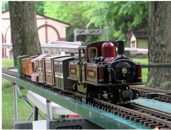
O gauge representation of a workers' train on the 2' Ffestiniog Rwy in Wales

SM45, respectively, to represent the modeling of these two distinct narrow gauge prototype domains. Of the over 4000 worldwide members of the 'Association' the vast majority reside in the U.K.; fewer than 100 live in North America. Last year, as the 'Association' celebrated its 40 th anni-