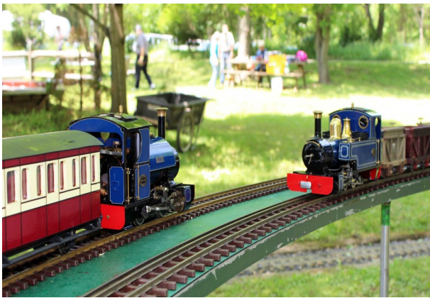
Two gauge 1 British narrow gauge locomotives visiting from Michigan

The Association of 16mm Narrow Gauge Modellers, which began in the U.K. over 40 years ago, is a group of (mostly) live steamers who model narrow gauge railways to a nominal scale of 16mm to the foot. At this scale, 0 gauge track (32mm) scales to 2' narrow gauge, and gauge 1 track (45mm) scales to 3' narrow gauge; we often use the shorthand SM32 and