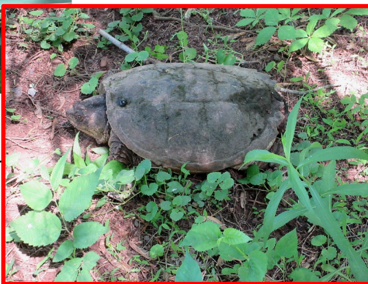
Snapping Turtle spent all day Friday laying eggs near the narrow gauge steamers

For the Friday and Saturday of the Memorial Day weekend, we used the recently-completed rebuilt gauge 1 double track main line and supplemented it with two portable railways generously loaned