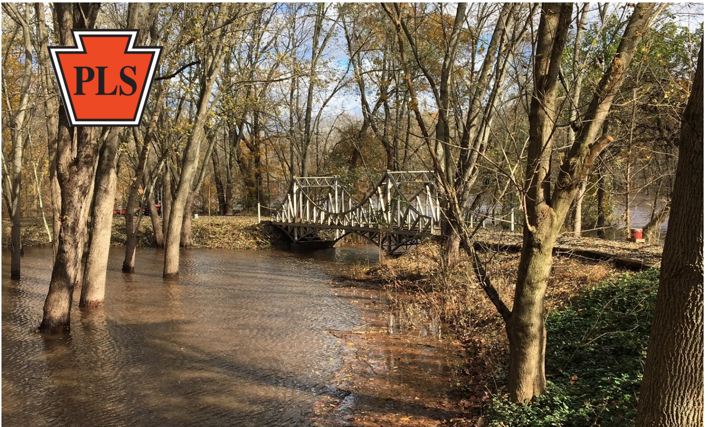
View of Mercer Bridge last November 3rd after heavy rains and flooding from the Perkiomen Creek. It was a wet season.