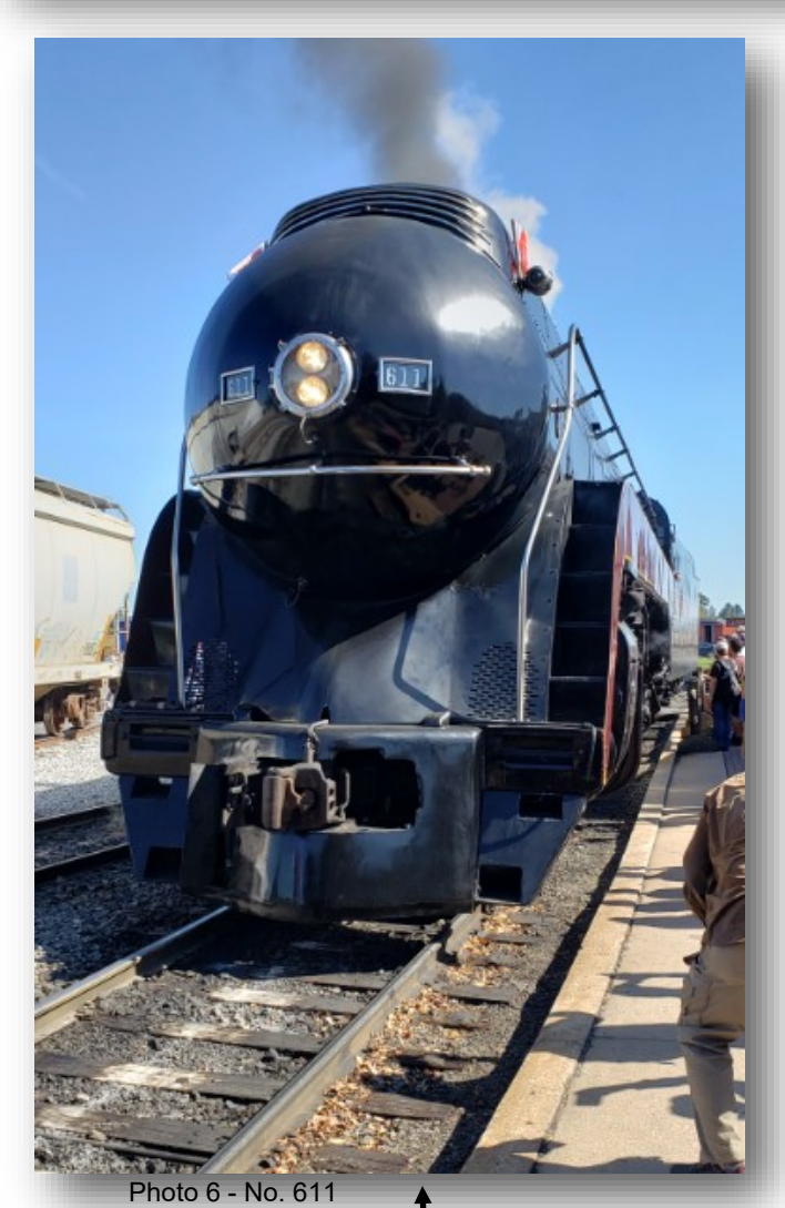
Pulling into Strasburg Station