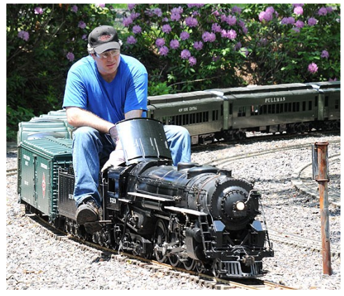
Good Day, PLS Members -

This is my first Gazette address in nearly 15 years and I hope I can be an effective communicator. As always, I am always happy to speak to anyone who is willing to cheerfully pitch in to carry on with the mission of this club. I do want to remined everyone that each-and-every one of us are VOLUNTEERS - DO NOT YELL AT US!