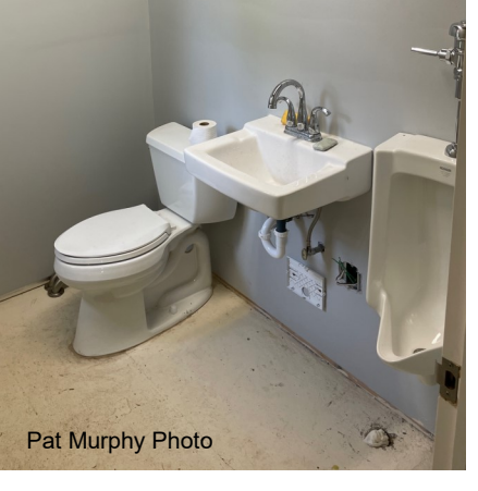
Men's room new drywall and plumbing.

New drywall was professionally installed in the meeting room.