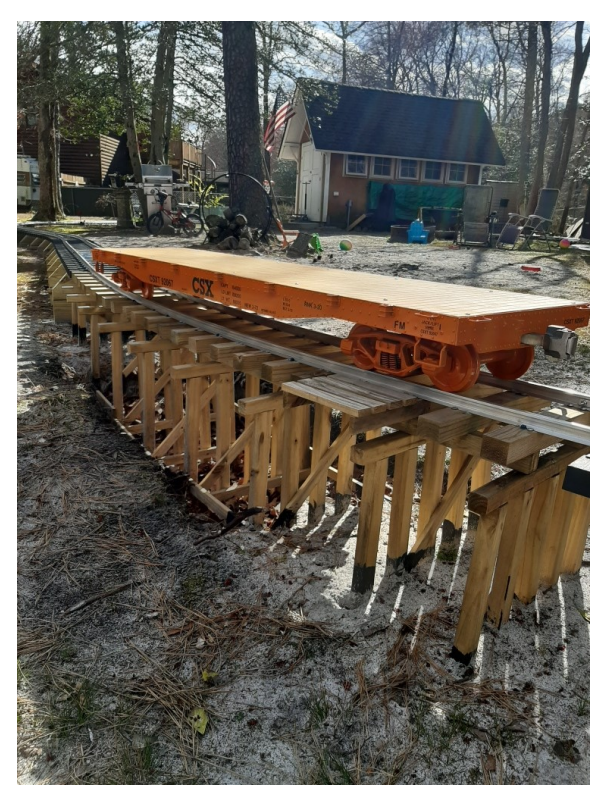
The Completed Project