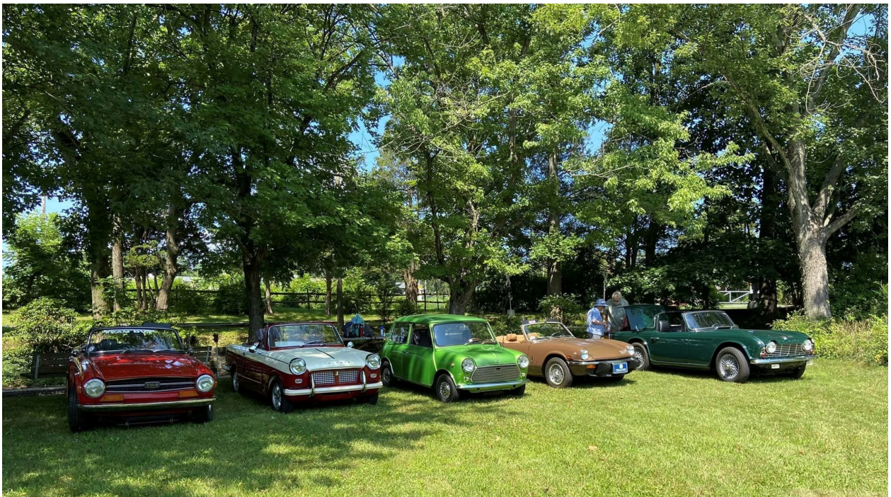
PLS played host to the DelVal Triumph Club. These are some of the sports cars they arrived in.