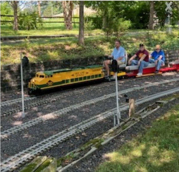
The Company Train rolls into the yard.