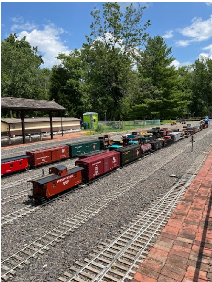
The yard beginning to fill with freight cars for the day's runs.