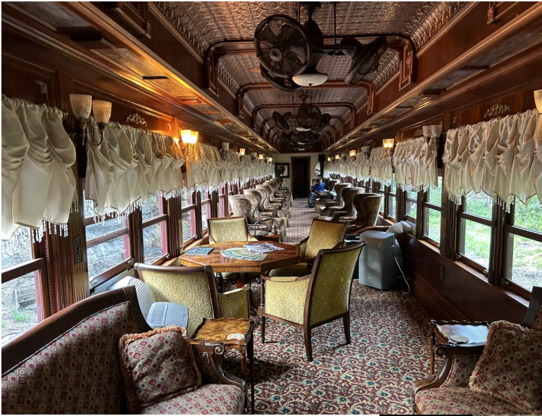
Space for a game of chance