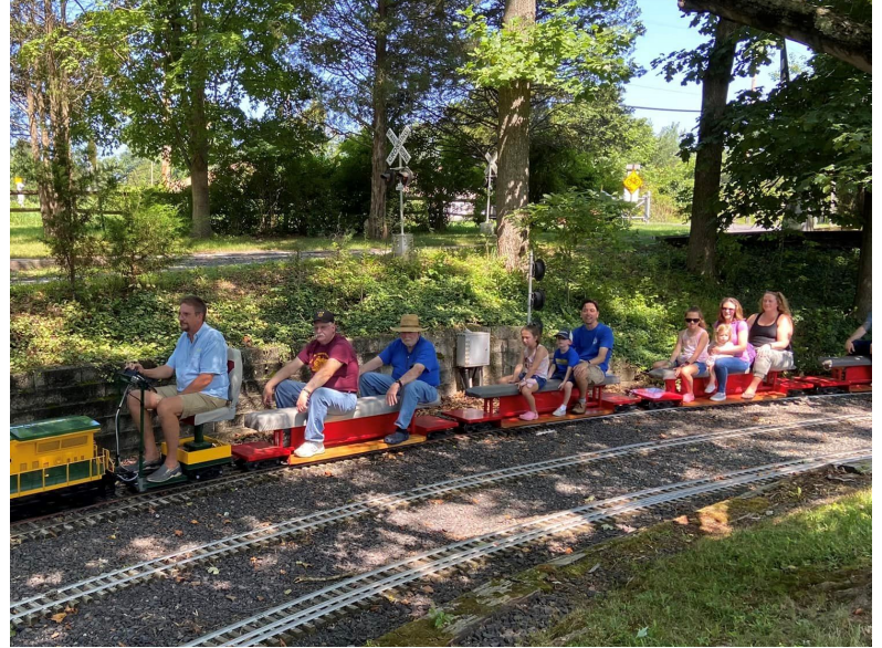
Beautiful day for a scenic ride through the woods.