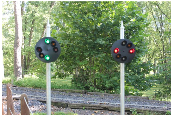
Looking for more clear signals ahead as we begin the 2024 running season.

Three cheers to Frank Webb who has led the effort to maintain our Signal System.