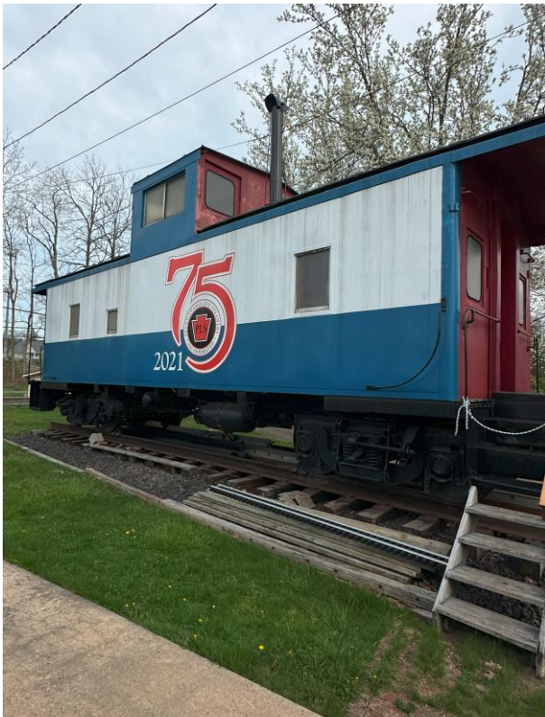
Looking at the Caboose, it is a reminder that our 80 th Anniversary is just 2 short years away. Hopefully we will have better luck celebrating that milestone than we did with our 75 th . Planning should start soon, please help us with this effort.