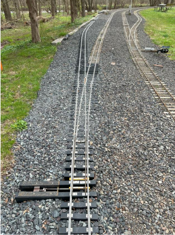
New Turnout installed just east of the Tunnel on the 4.75 track. The beginning of the new passing siding that will connect just before Mercer Bridge,