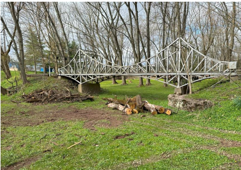
Some of the remains of the tree that fell east of Mercer Bridge.