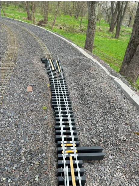
The new turnout at Mercer Bridge is in place and still needs to be connected to the 4.75 Main Line on both ends.