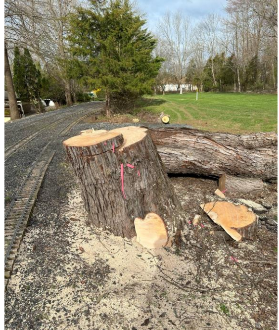
The most dangerous Tree on the property is down as the cleanup continues. Three other trees were taken down. One had fallen down this winter east of Mercer Bridge, another was partially down along the path to the Mercer Bridge. The other was a tree in bad shape near the main entrance.