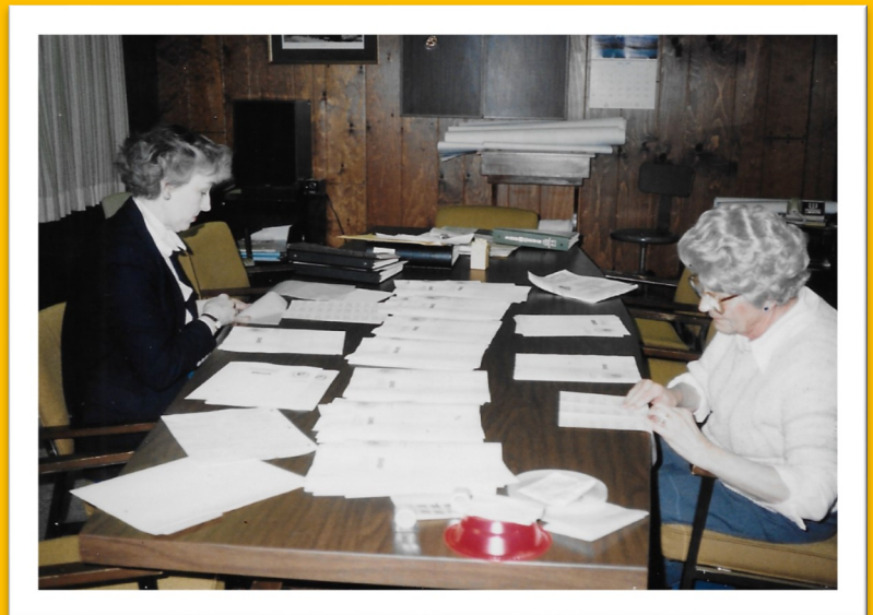
The Gazette is assembled and readied for mailing by members' spouses in space loaned by a member. Names and date unknown.