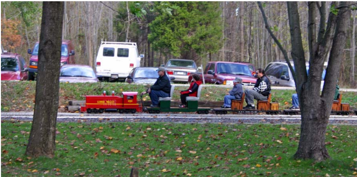
October Blow Down Day