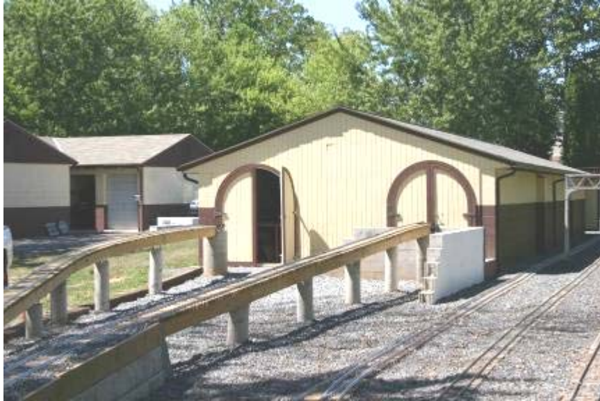
Car storage barn Sept. 2007

The PLS Gazette P.O. Box 26202 Collegeville, PA 19426-0202