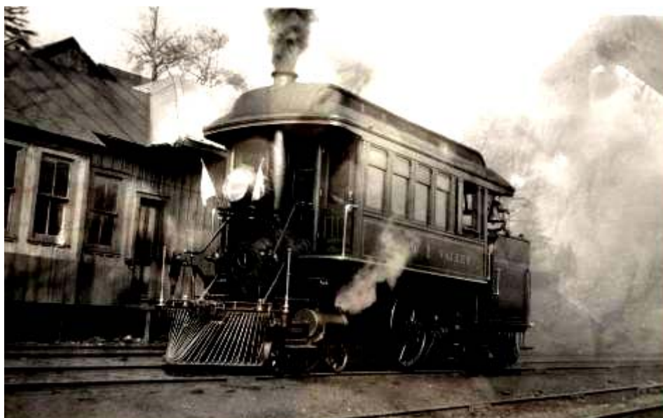
The above photo was from Frank Watson's collection labeled as Bullock's 001