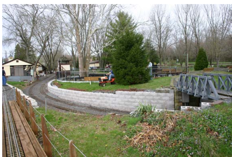
April 2008- New Retaining Wall