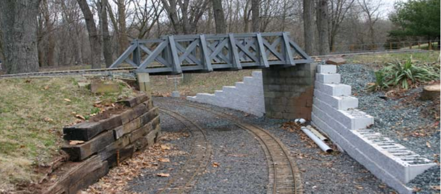
March- 2008- New Retaining Wall