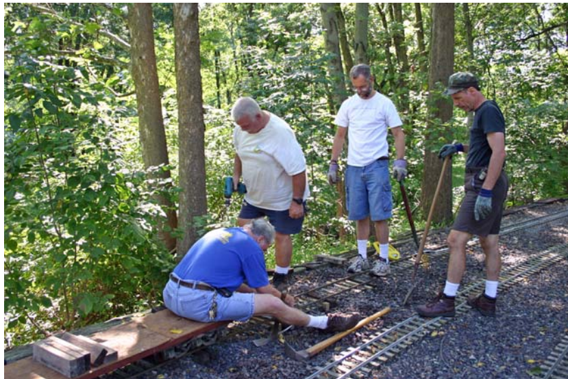
Track work- Come out and help