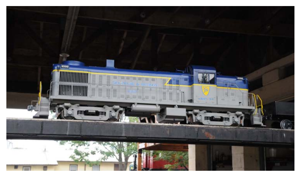
Above: Bob's one-inch scale D&H RS-3 diesel built from a kit. Below: Bob selects a route in the the yard area during the July 18, 2009 club picnic.

Bob's background comes in very handy in this situation. PLS members use surveying instruments to accomplish this task but also much paper work must be done before they can even begin to pound stakes into the ground. Oftentimes on workdays you will find Bob poring over his paperwork with track diagrams spread