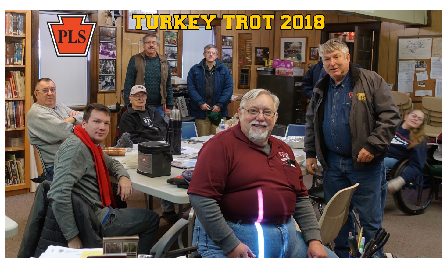
The Gauge 1 Crew takes a lunch break during the cold at this year's Turkey Trot event on Black Friday. See more photos on page 5.