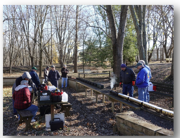
Still a lot of activity later in the day

It was a cold day but those hardy souls who came out for the run had a great time in the crisp fall air.