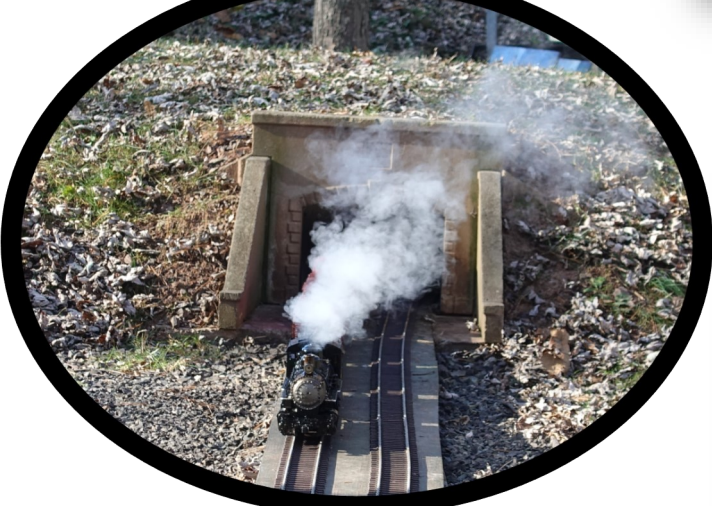
Cold air made for some great steam plumes