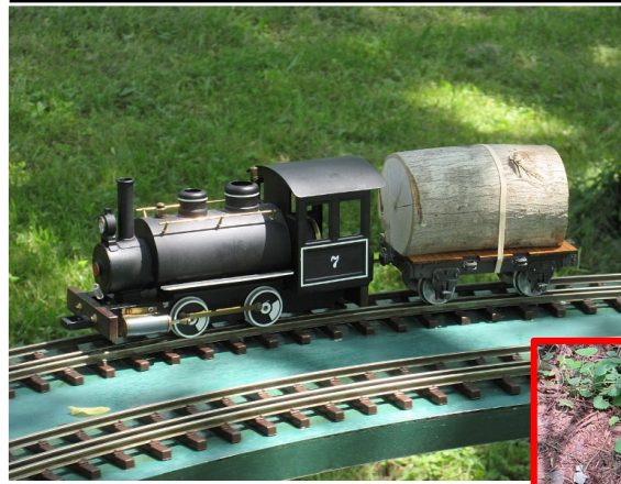
Generic Baldwin narrow gauge tank locomotive visiting from New Hampshire

SM45, respectively, to represent the modeling of these two distinct narrow gauge prototype domains. Of the over 4000 worldwide members of the 'Association' the vast majority reside in the U.K.; fewer than 100 live in North America. Last year, as the 'Association' celebrated its 40<sup>th</sup> anni-