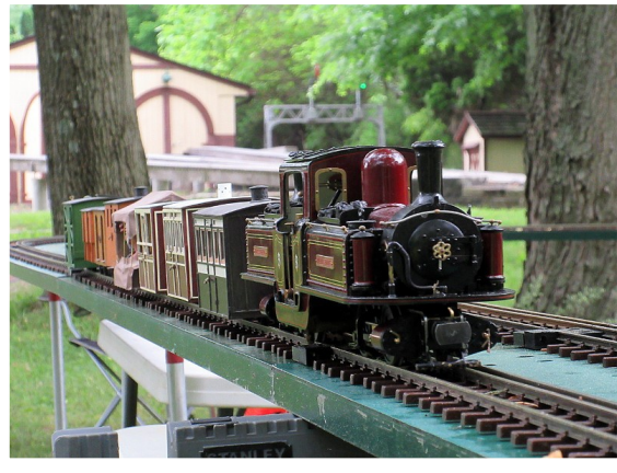
O gauge representation of a workers' train on the 2' Ffestiniog Rwy in Wales

SM45, respectively, to represent the modeling of these two distinct narrow gauge prototype domains. Of the over 4000 worldwide members of the 'Association' the vast majority reside in the U.K.; fewer than 100 live in North America. Last year, as the 'Association' celebrated its 40<sup>th</sup> anni-