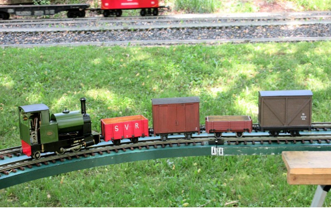
O gauge model of a British narrow gauge loco built for the Bowater Paper Company mills in Kent

Participants in the Annual Gathering came from well beyond the Mid-Atlantic states; we had folks from New England, the Midwest, the Northwest, Canada, and even one registrant who flew in from Australia. The variety of locomotives which they brought was quite diverse, representing the work of model lo-