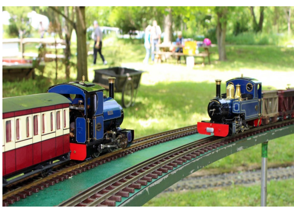
Two gauge 1 British narrow gauge locomotives visiting from Michigan

The Association of 16mm Narrow Gauge Modellers, which began in the U.K. over 40 years ago, is a group of (mostly) live steamers who model narrow gauge railways to a nominal scale of 16mm to the foot. At this scale, 0 gauge track (32mm) scales to 2' narrow gauge, and gauge 1 track (45mm) scales to 3' narrow gauge; we often use the shorthand SM32 and