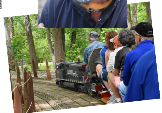
Spring Event Photos