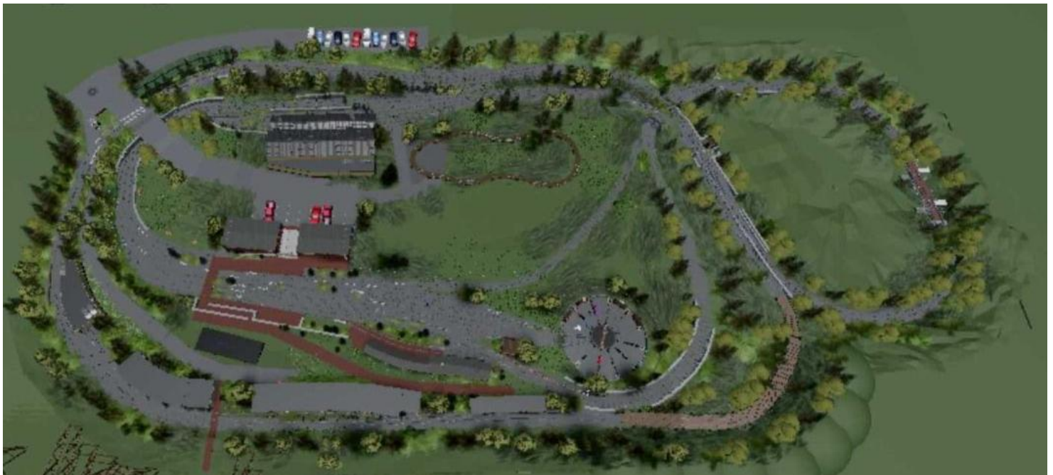
Overview of the 3D RSS Model of the PLS Layout

I wanted to keep the theme of live steam, but I also wanted to try my hand at making a real-life live steamers. Currently in the OPS program, there was only a single live steamers that was a copy of a real life one, that being LALS. During school I went online and looked up live steamers near me, since I wanted to make one that was close to my home. That was my first time learning about Pennsylvania Live Steamers, I went on the website and just spent hours looking at gallery photos and the track layout wondering if it would be possible to remake this in RSS. I also watched the YouTube video "Trip Around Pennsylvania Live Steamers Behind Gizmo" about a million times. After looking at my other options, I decided that PLS would be the railroad I would remake in RSS. Me and a few friends spent hours researching the line, all facilities, and scouring the internet for any video we could find. We had trouble because PLS is not the most well-documented place, but we managed.