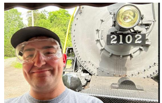
Me and 2102