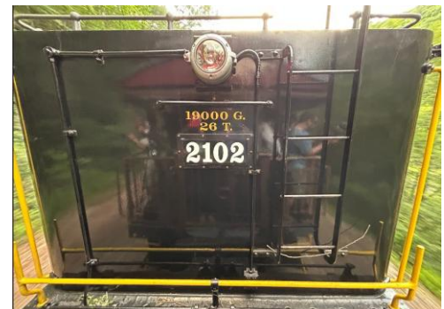
RBMN T-1 No.2102's Tender