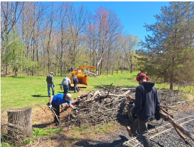
More wood being dragged into the pile. Note even some of the small pine trees were cut down and added to the mix.