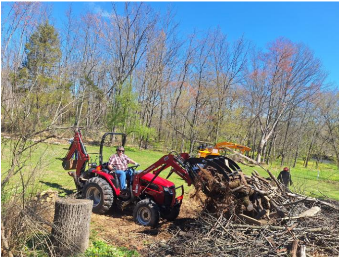
And so Chipper Day begins trying to get the pile closer to the chipper.